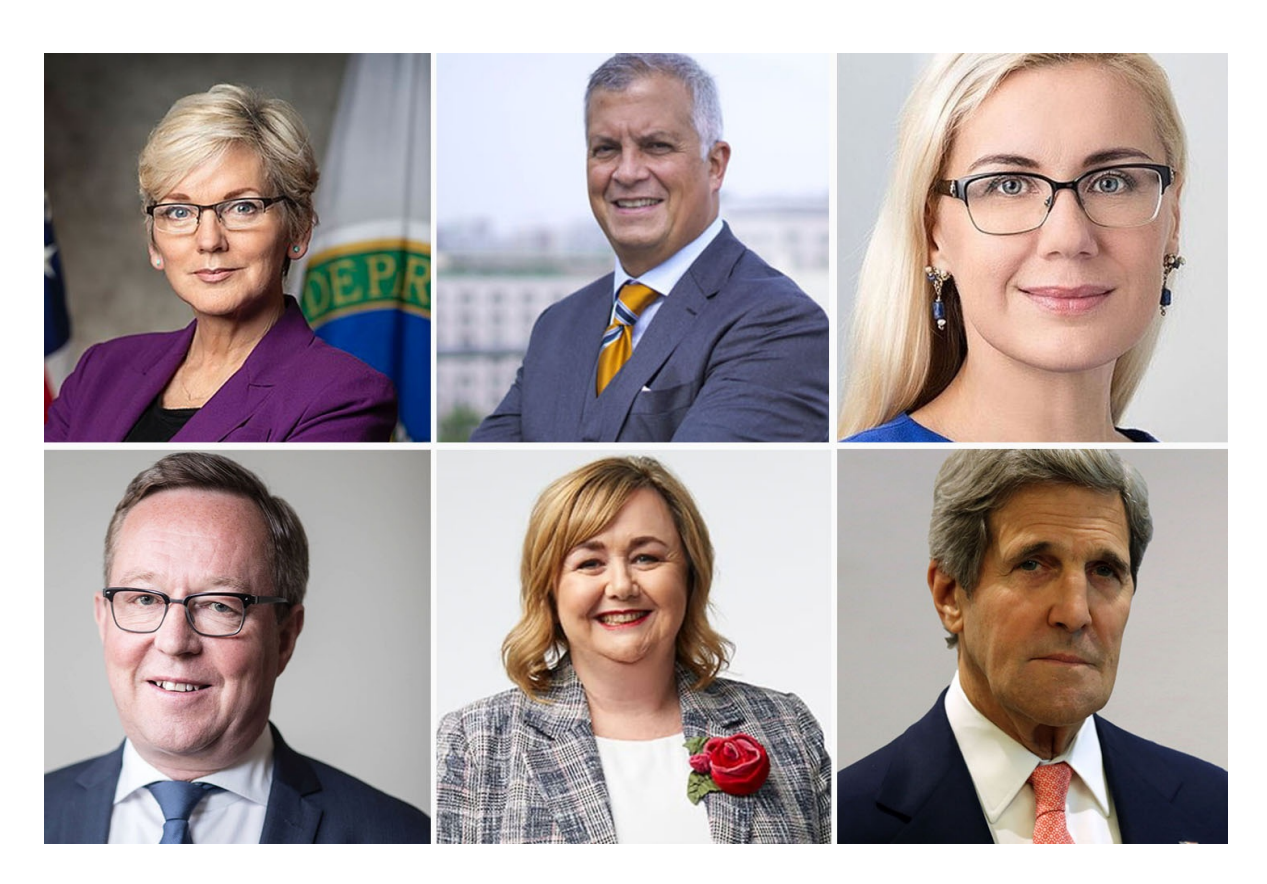
GCEAF will take place in Pittsburgh, United States, from 21-23 September. Registration is free so be sure to sign up today to reserve your spot.

We're just over one month away from the most important international clean energy meeting of the year, the <u>Global Clean Energy Action Forum (GCEAF)</u>. The Forum will be critical in shaping the clean energy agenda at COP27 and moving us towards our ultimate goal: achieving net-zero. GCEAF is the home of the 13th Clean Energy Ministerial (CEM) and the 7th Mission Innovation (MI) ministerial, and is hosted by the US Department of Energy.